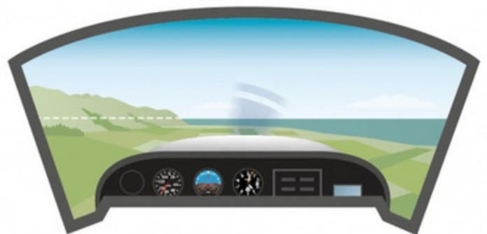
Figure 1. The horizon is where the sky meets the sea - this needs to be imagined and superimposed over terrain or weather where the sea isn't visible.

(where the sky meets the sea, or an imagined line superimposed over terrain or weather), and then checked by reference to the aeroplane's instruments (see Figure 1, below).